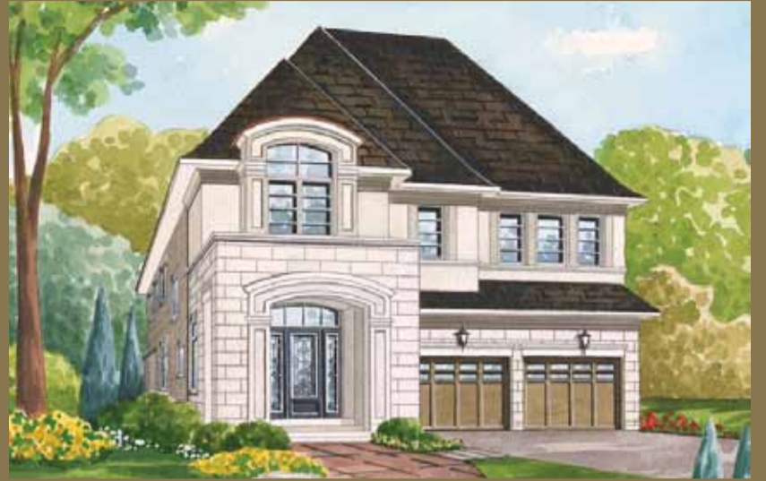
{ ELEV B }

Materials, specifications, and floor plans are subject to change without notice. All house renderings are artist's conceptions. All floor plans are approximate dimensions. Actual usable floor space may vary from the stated floor area. E.A. O.I. 3804