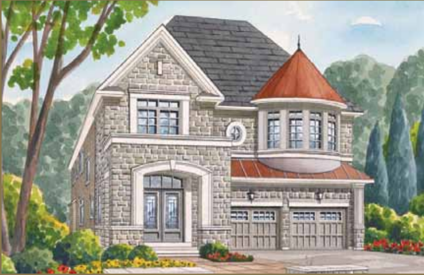
{ ELEV A }

3205 sq. ft. { ELEV A } 3201 sq. ft. { ELEV B } { includes 150 sq. ft. finished foyer in basement }